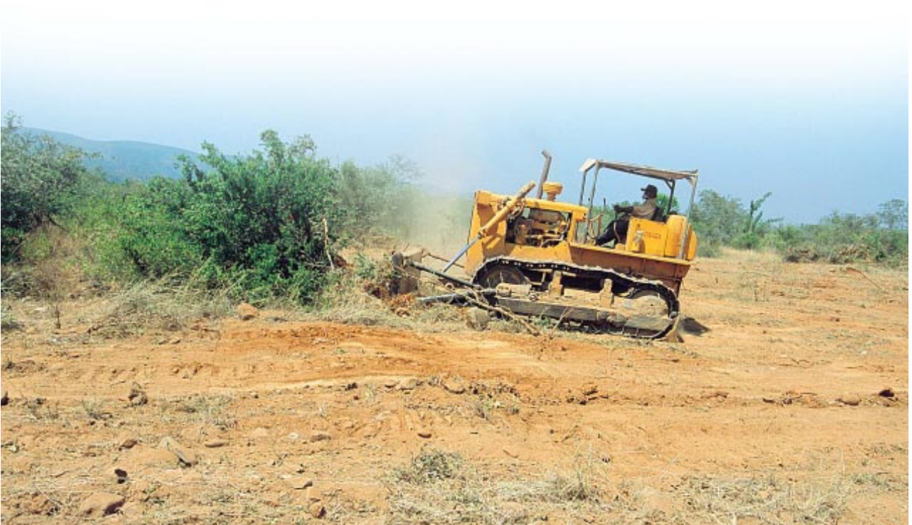
Nearly 7 ha of the suitable habitat of the Jerdon's Courser was cleared near the Sri Lankamaleswara Wildlife Sanctuary for the Telugu-Ganga Canal construction

If water flows in that Canal it will be a lifeline for many. But, for the Jerdon's Courser